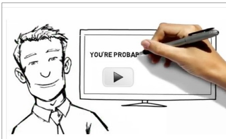
The 'Animated' Video

Before doing anything, you need to write down what your primary objective for the video is. In reality there are only two primary objectives for any website or landing page: to generate a lead or to get a sale (or a combination of both).